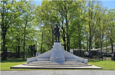
Relocated Johnston statue at Huff House that was his headquarters.