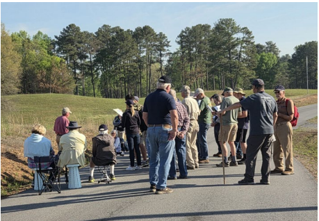
On the Confederate right at Resaca, also the site of annual reenactment.

In the photo at left, the tour group visits a rediscovered grave site, where ten Confederate cavalry men were initially buried on 9 May 1864 and where at least seven remain. For the story of the rediscovery, see the May-June 2026 issue of Civil War News Magazine .