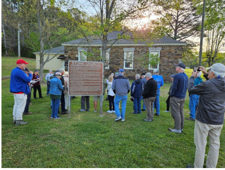
First tour stop was Old Stone Church.