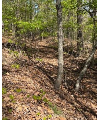
Part of Confederate trench that extended across Crow Valley.