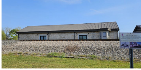
Renovated Tunnel Hill Depot now better evokes its wartime appearance.