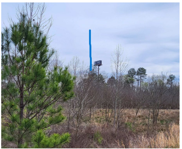
Blue line indicates where tower will appear from Site interpretive kiosk #2.

Georgia Battlefields Association PO Box 669953 Marietta GA 30066