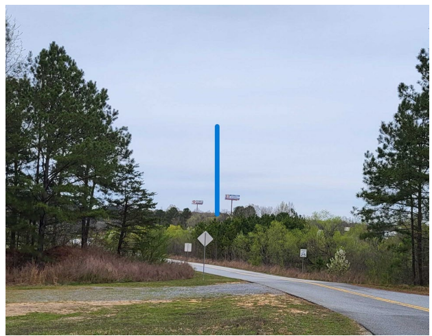
Blue line indicates where tower will appear from Historic Site entrance road.

*Section 106 of the National Historic Preservation Act of 1966 requires federal agencies to evaluate the effects of their proposed actions on historic or cultural resources and to give the Advisory Council on Historic Preservation a reasonable opportunity to comment. The relevant federal agency in this case is the Federal Communications Commission.