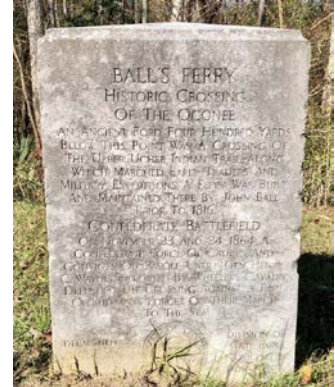
Monument at site of late November 1864 actions at Ball's Ferry.