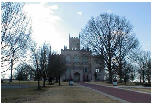
Wartime capitol in Milledgeville. Interior visits have been suspended due to virus restrictions. We believe the building will be open by October.

Cost is $430 per person. Your reservation is confirmed when payment is made, either by sending a check to Georgia Battlefields Association at PO Box 669953, Marietta GA 30066, or by paying online through www.georgiabattlefields.org .