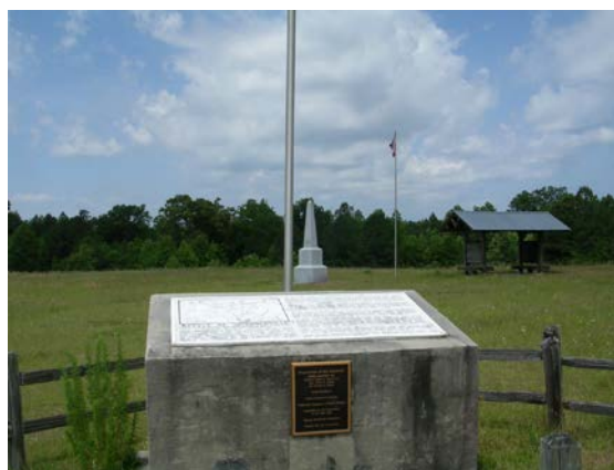
Griswoldville Battlefield Park, which was acquired using funds raised by GBA, then deeded to Georgia State Parks..