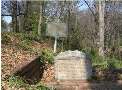
Monument where Manigault's Brigade reformed during 22 July 1864 Battle of Atlanta. The marker behind the monument would not be included.