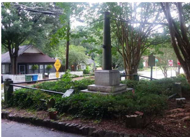
McPherson monument fence damage: Vehicle hit post now in pieces in right foreground.

Again, the McPherson and Walker monuments and markers recount battlefield events without bias and are not courthouse or capitol grounds statues or plaques. GBA feels strongly that battlefield markers and monuments that contain accurate texts should not be removed, and a marker or monument at any location should not be defaced or otherwise damaged. It is the purview of local governments to remove or reinterpret non-battlefield monuments.