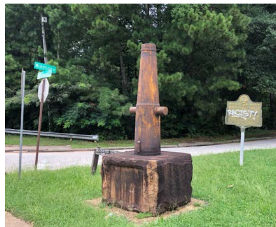
Walker monument site with RACIST! painted on marker.