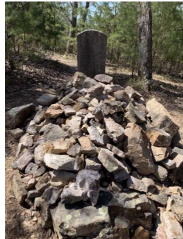
Grave before vandalism

On 22 December, Congress returns military rule to Georgia and specifies that, to be readmitted to the Union, the state legislature must remove unauthorized members and approve the 15 th Amendment. Already headquartered in Atlanta, Brigadier General Alfred Terry is assigned as commander of the reinstated Third Military District.