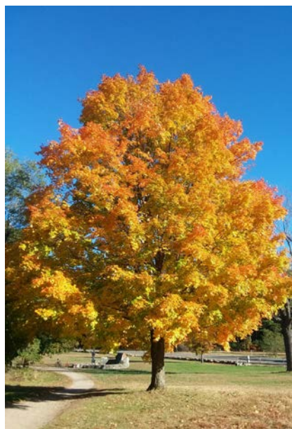
Fall color at Paul Revere capture site (monument beyond tree).