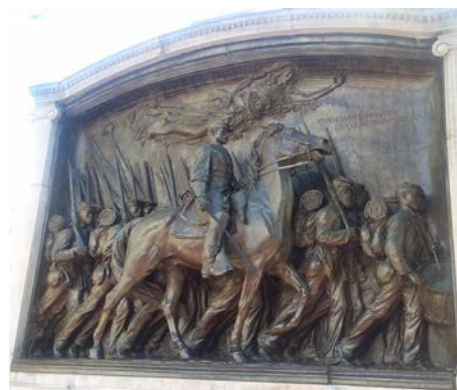
On Boston Common across from the state house is the memorial to Civil War's 54 th Massachusetts Infantry and its commander, Colonel Robert Shaw, killed in the 18 July 1863 assault on Fort Wagner, near Charleston.

Georgia Battlefields Association PO Box 669953 Marietta GA 30066