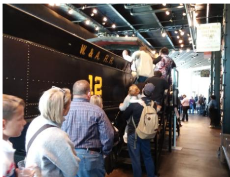
The line to get into the cab

While the locomotive and milepost are premier attractions, the exhibit addresses more broadly the importance of railroads to the existence and growth of Atlanta. The Atlanta History Center has significantly enhanced its ability to present the city's story.