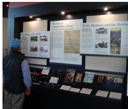
Locomotive Chase display