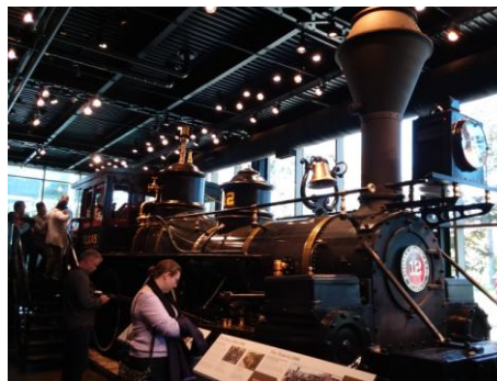
New waist-level display