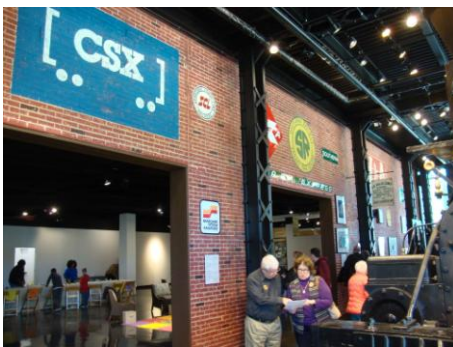
Railroad logos line the wall