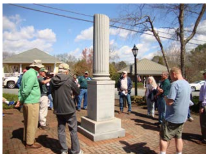
At the monument to Roswell men who served the Confederacy and Roswell women mill workers.