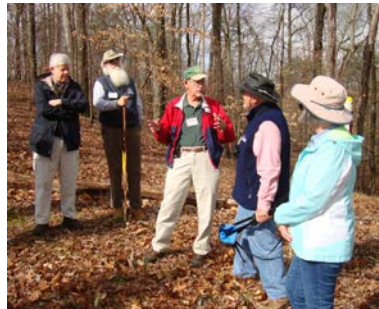
Discussions often lead to better understanding for participants and the guide.