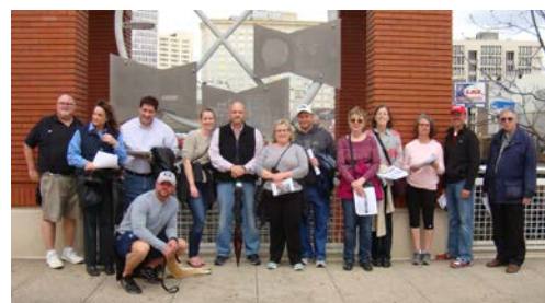
Photo shows the 18 March group near the 1864 site of the car shed. One marker in the background mentions the 1920s viaduct system that raised the street level above the 1864 grade.

For Atlanta Preservation Center's annual Phoenix Flies series, Georgia Battlefields Association led walking tours of Civil War Atlanta on 4 and 18 March. We had good weather both days.