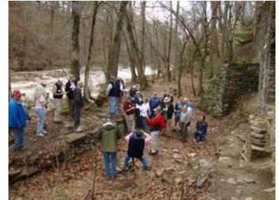
At Sope Creek paper mill ruins.