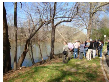
At the fish dam where the Federals first crossed the Chattahoochee River.