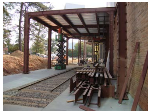
Photo shows tracks for Texas in November 2016.

After 17 months of conservation in North Carolina, locomotive Texas is scheduled to return to Atlanta in early May. Texas will rest on tracks relocated from its former location in Grant Park. It will be in the hall leading from the main Atlanta History Center museum to the new cyclorama building. A glass wall will make Texas visible from West Paces Ferry Road, and it will be illuminated at night.