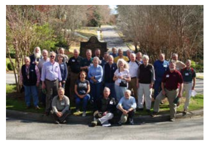
Group photo at Confederate gun position marker.