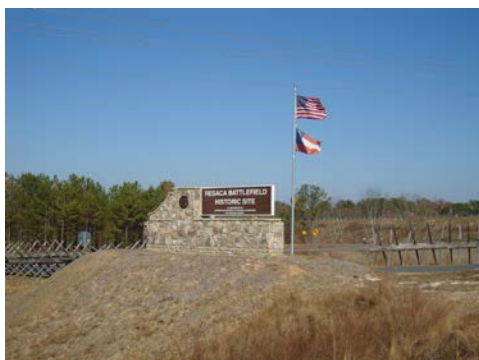
Left: Entrance to historic site, just west of I-75 exit 320.

From 1 November through 31 May, the Resaca State Historic Site is open 8 a.m. to 5 p.m. on Friday, Saturday, and Sunday. www.gordoncountyparks.org . You may still see some fall colors, but the decreasing foliage and low sun angle make both the Confederate and Federal earthworks much easier to distinguish. At the site, you can get a tour map of the area showing Fort Wayne Civil War Historic Site on the east side of I-75 and, farther north on US 41, the WPA pavilion, the Confederate cemetery, and the 474-acre conservation easement on battlefield land. GBA contributed $125,000 towards the easement and the outright purchase of 51 of those acres.