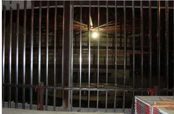
The viewing platform is visible towards the bottom of this nighttime photo through the outer wall framework.