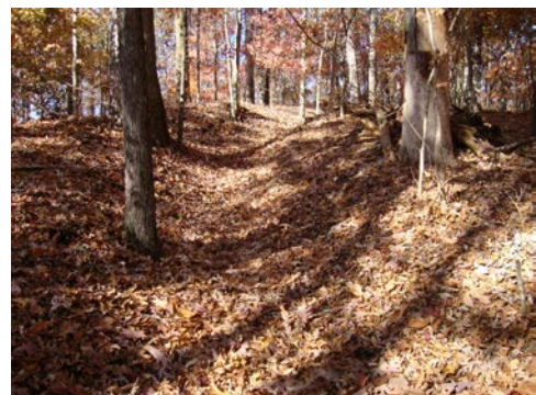
Right: Trenches are easier to see with less foliage and low sun angle.