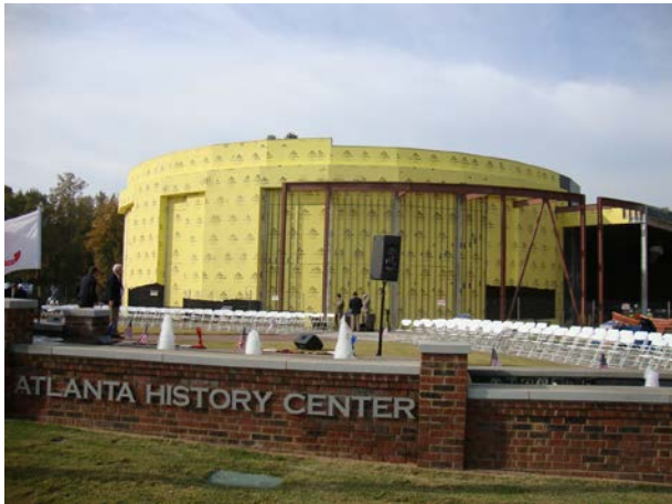
Looking south from West Paces Ferry Road on Veterans Day. The overhang to the right will be the hallway in which Texas is displayed so it will be visible from the road and lighted at night.

www.atlantahistorycenter.com/explore/coming-soon-atlanta-cyclorama .