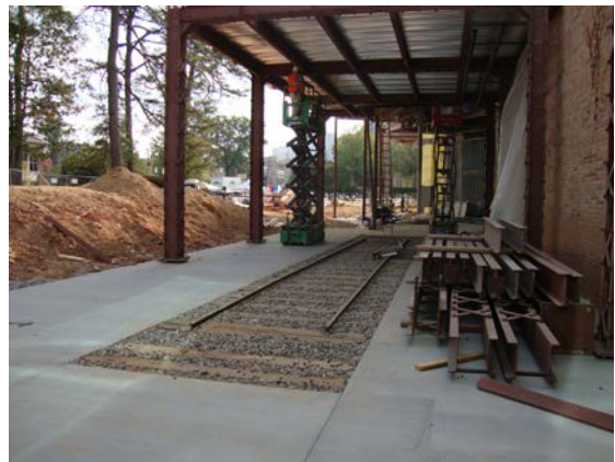
Looking east from the café and bookstore in the main museum building. Tracks for Texas were brought from the Grant Park building.