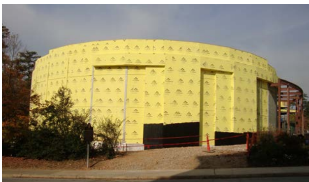
Looking west across Slaton Drive on Veterans Day.