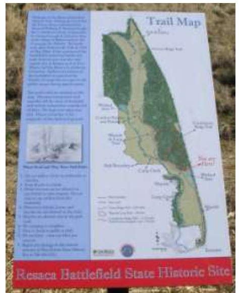
New site trail map marker